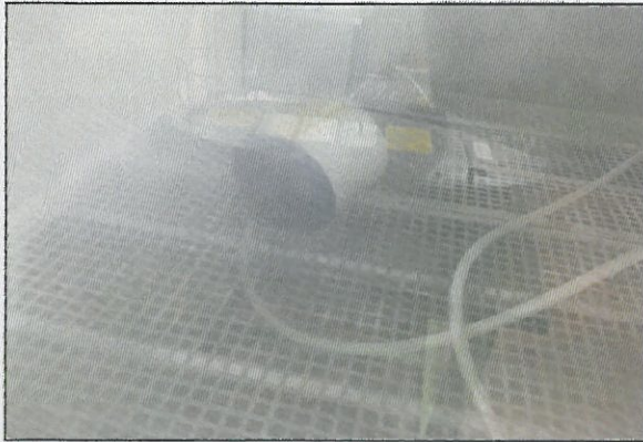
IP 6X (Dust)