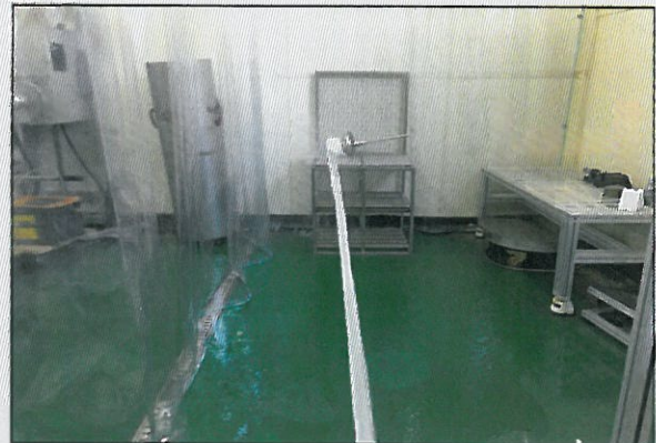
IP X6 (Water)