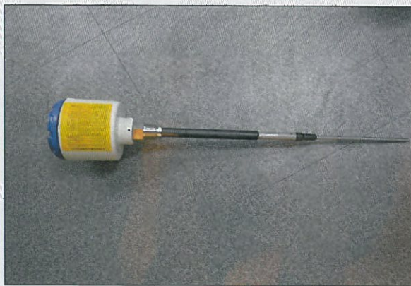
[Fig. 1: Front]