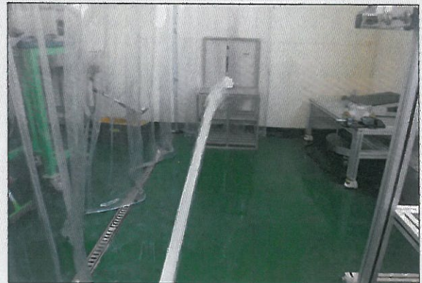
[Fig. 4: IP X6]