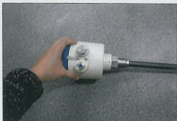
[Fig. 2: Side]