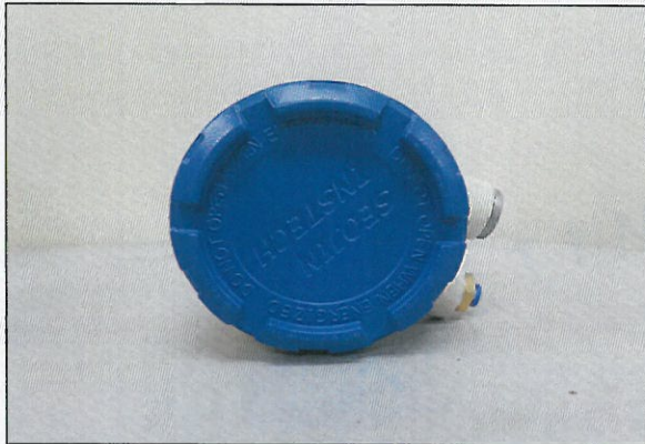
[Fig. 1: Head]