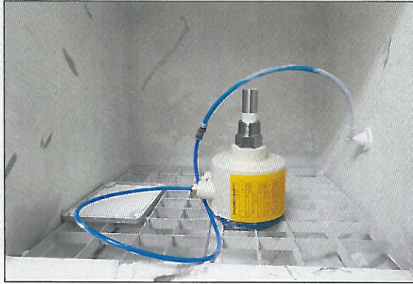
[Fig. 3: IP 6X]