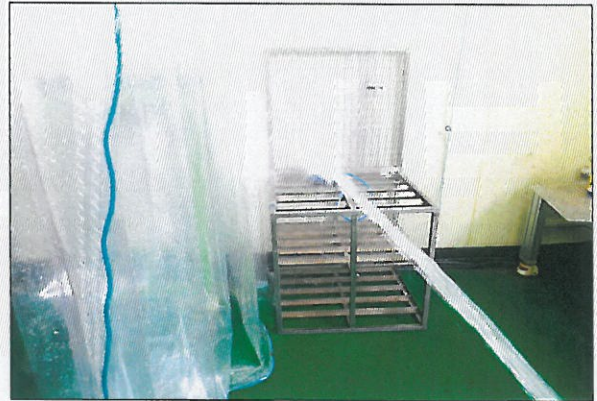
[Fig. 4: IP X6]