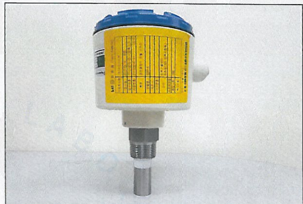
[Fig. 2: Side]