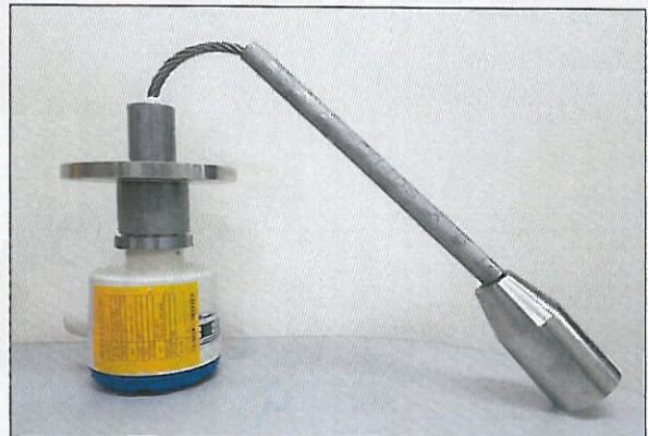
[Fig. 2: Side]