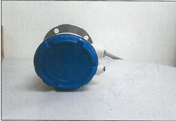
[Fig. 1: Head]